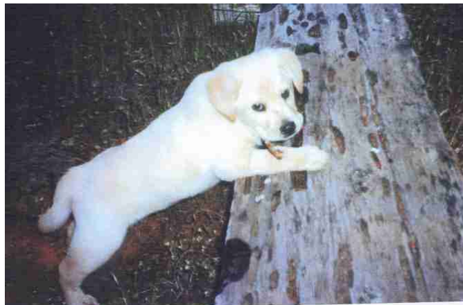
Kuon and his first bone.

All Scripture unless otherwise noted is from the New American Standard Version of the Bible. Copyright by the Lockman foundation.